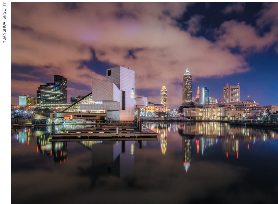
Cleveland, Ohio, is experiencing a thriving biomedical-science ecosystem.

NATUREJOBS For the latest career listings and advice www.naturejobs.com